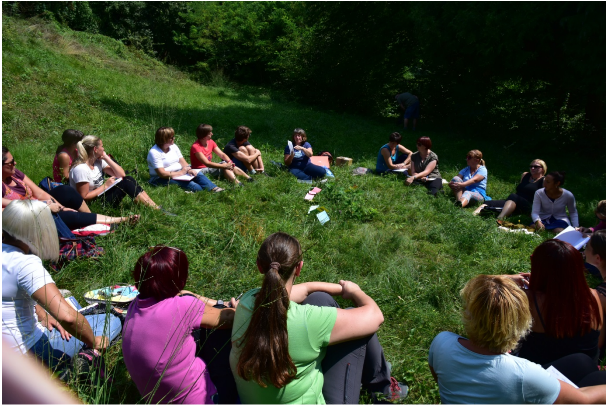
Biodiversity for Early Years workshop