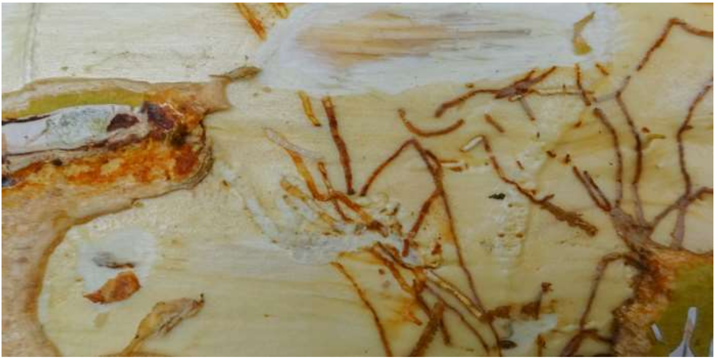
Bronze birch borer larvae beneath the bark of a silver birch tree